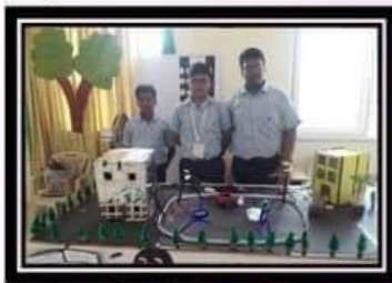
#Srians with their project

SSA Kolkata participated in the SSRVM Science Fest organized by the Sri Sri Ravishankar Vidya Mandir Trust at Bangalore between 22 and 24 December 2018. Various other Sri Sri schools throughout India participated in the Fest. It was an exhibition and competition based on the various ideas of the young individuals. Students of Classes 7, 8 and 9 participated in the competition from SSA Kolkata. Their exhibit was a model of a 'Future City' where they displayed all the modern facilities and the technologically improved devices to ease the difficulties of the physically challenged and to combat pollution, especially noise pollution which causes trauma in most of us. It is with great pride that we write that the Srians bagged the First prize.