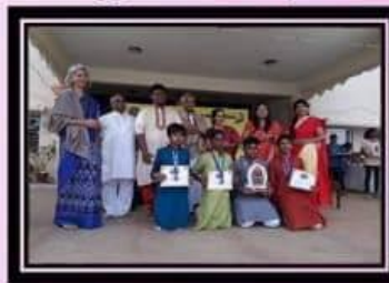
#Srians with the trophy and certificates in hand at Bengaluru SSRVM Science Fest