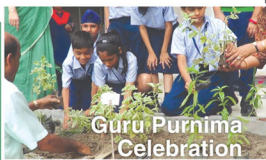
Guru Purnima Celebration

Guru Purnima was celebrated as No Plastic Day and Environment Day. To spread our Founder's Message the students of Class V planted herbs in the lawn near Saraswati Mandap to create a herbal garden.