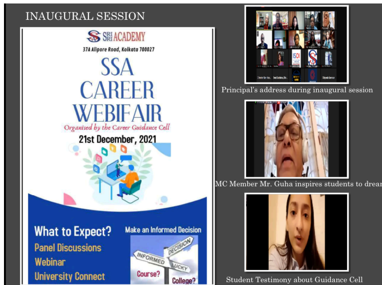
Principal's address during inaugural session

upon the students who were participating in the fair to gather as much information as possible from the panel discussions, the webinar and through networking with the university representatives.