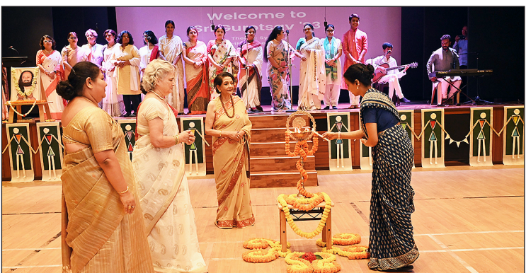
The inauguration of Gurotsav Fest, 2023, an inter-school event organised by Sr Sri Academy to mark the birth anniversary of its founder. Nine schools from the city took part in the fest that also saw teachers performing along with students