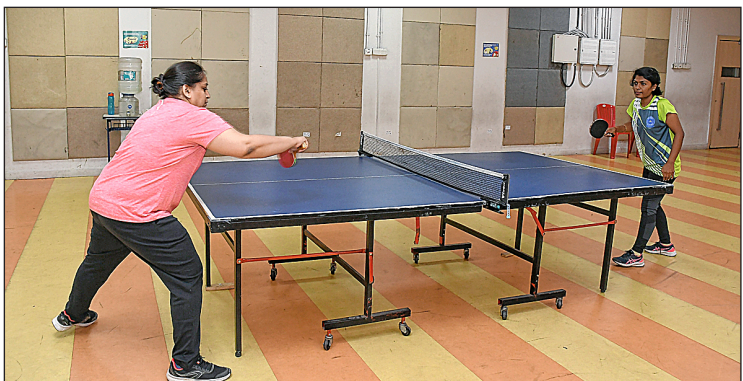
Students and teachers engage in a table tennis game at an inter-school fest organised by Sri Sri Academy, Kolkata, to mark the birth anniversary of their founder