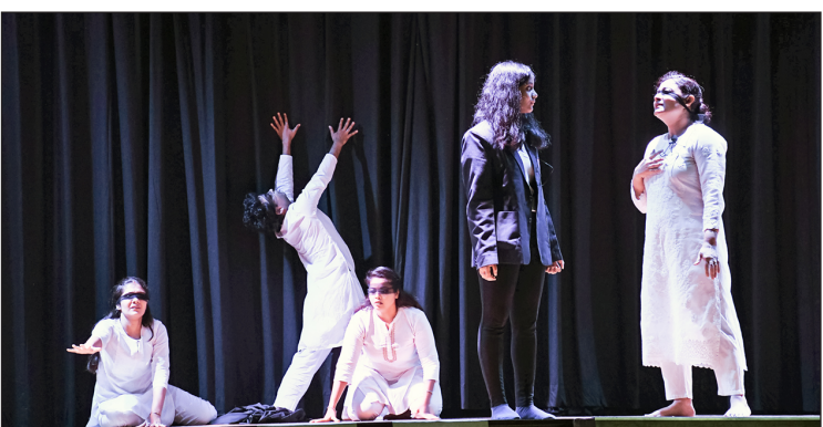
Team Sri Sri Academy takes part in a dance performance at their annual fest