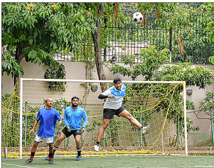
Teachers from different city schools lock horns in a football match as part of Sri Sri Academy's Gurotsav Fest, 2023

Some of the participating schools included Birla High School, Frank Anthony Public School, The Heritage School, Future Foundation, South City International and Asian International School.