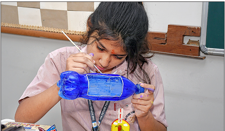
A student tries to turn waste into something productive at the Sri Sri Academy inter-school fest